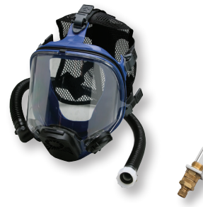
LP Adapter w/ waist belt included