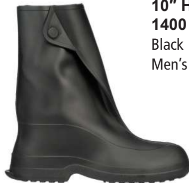
10" Ht Work Rubber Boot 1400 Black Men's Size: S - 3X