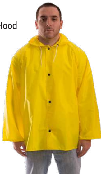
J21107 Yellow - Attached Hood S - 4XL