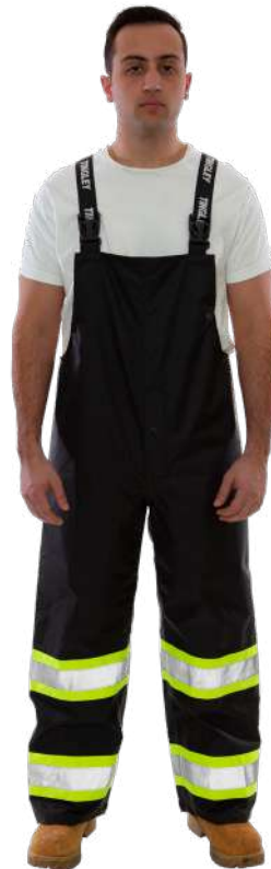
Icon Overalls O24123C Black - Snap Fly Front S - 5XL