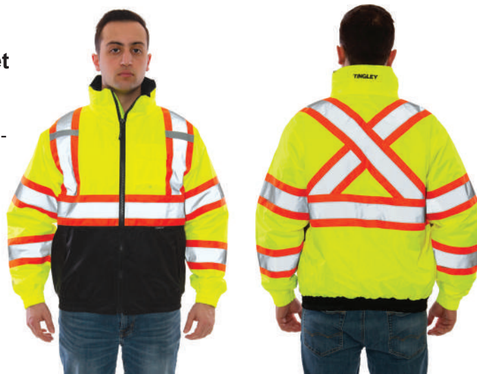
Bomber II Jacket J26122C Fluorescent Yellow-Green/Black - Detachable Hood S - 5XL