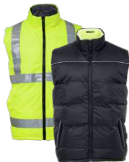
Reversible Insulated Vest