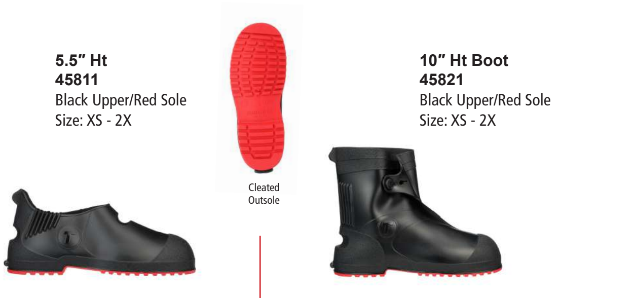
5.5" Ht 45811 Black Upper/Red Sole Size: XS - 2X