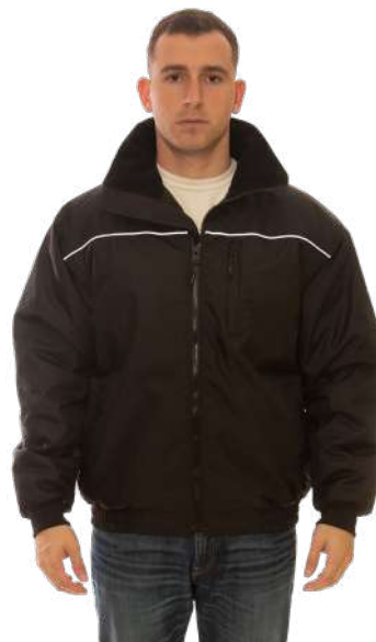
Bomber 1.5 Jacket J26113 Black - Attached Hood S - 3XL