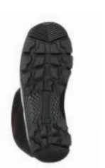
Deep lug cleats in a unique tread pattern provides traction in snow, slush and mud.