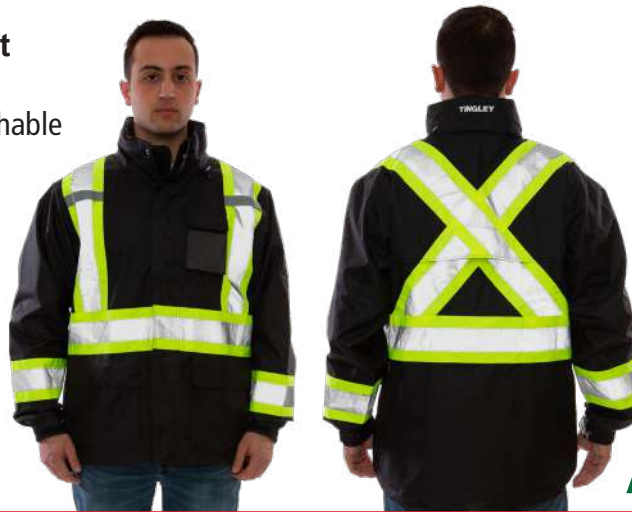
Icon Jacket J24123C Black - Detachable Hood S - 5XL