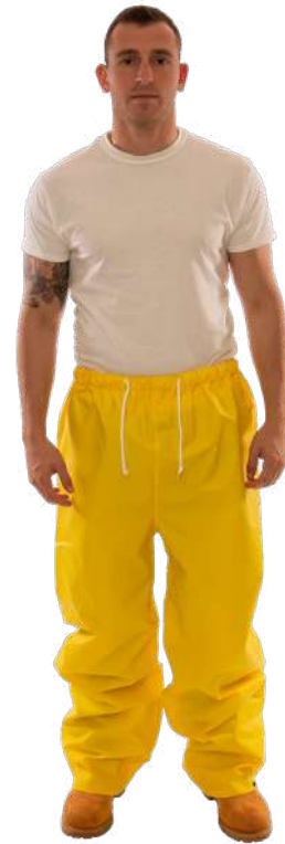
Overalls O56007 Yellow - Plain Front S - 3XL