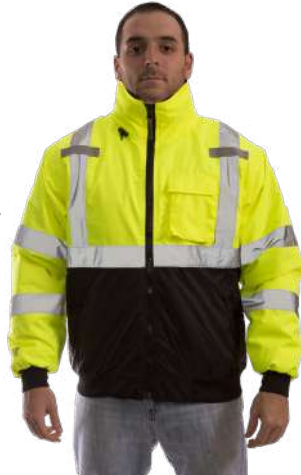
Bomber Jacket J26002 Fluorescent Yellow-Green/Black - Attached Hood S - 5XL