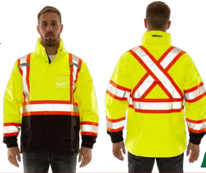
Icon Jacket J24122C Fluorescent Yellow- Green/Black - Detachable Hood S - 5XL