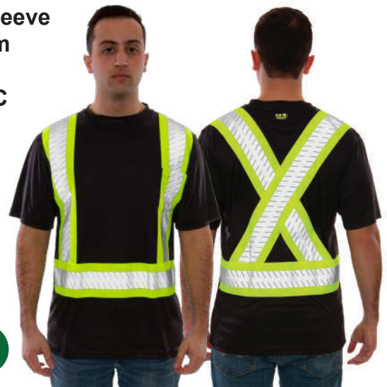
Short Sleeve Premium T-Shirt S74023C Black S - 5XL