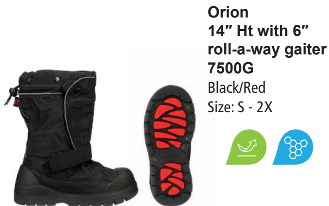
Orion 14" Ht with 6" roll-a-way gaiter 7500G Black/Red Size: S - 2X