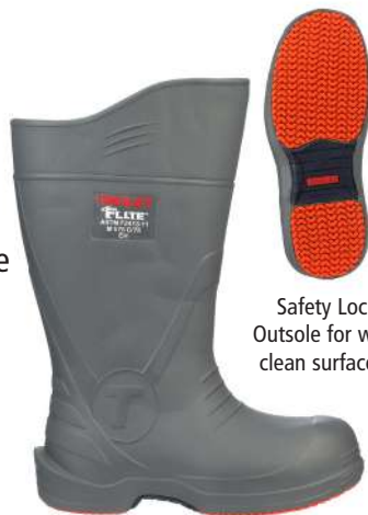
Safety Loc Outsole for wet clean surfaces

Gray Upper/Orange Sole Men's Size: 4 - 15 Women's Size: 6 - 12