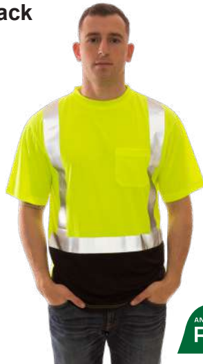
Short Sleeve Black Front T-Shirt S75122 Fluorescent Yellow-Green/Black S - 5XL