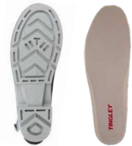
Chevron Plus® Outsole