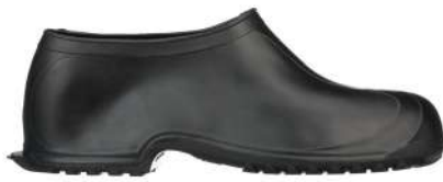
Classic Fit* Hi-Top Work Rubber 2300 Black Men's Size: S - 2X