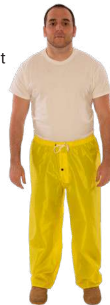
Pants P21107 Yellow - Snap Fly Front S - 3XL