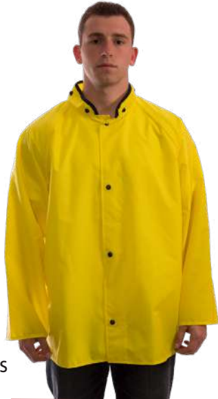
Jacket J21207 Yellow - Hood Snaps S - 4XL