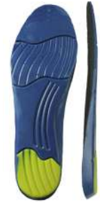
Gel Cushion Insole