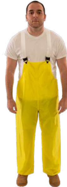
Overalls O21007 Yellow - Plain Front S - 4XL