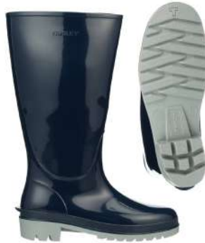
Women's Trim Fit Knee Boot 51446 Navy Upper/Gray Sole Women's Size: 5 - 10