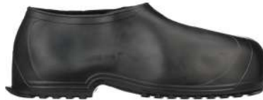
Hi-Top Work Rubber 1300 Black Men's Size: S - 3X