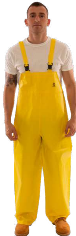
O56107 Yellow - Snap Fly Front S - 5XL