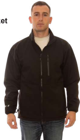
Phase 3 Soft Shell Jacket J25013 Black - Collared S - 3XL