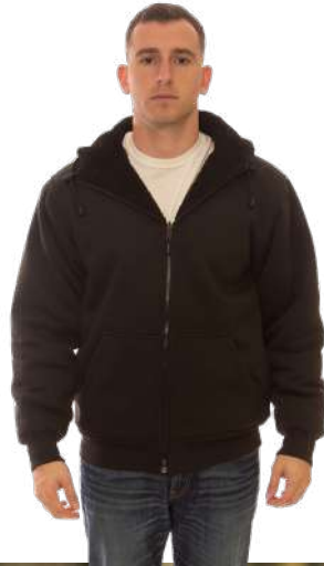
Insulated Sweatshirt S78143 Black - Hooded S - 3XL