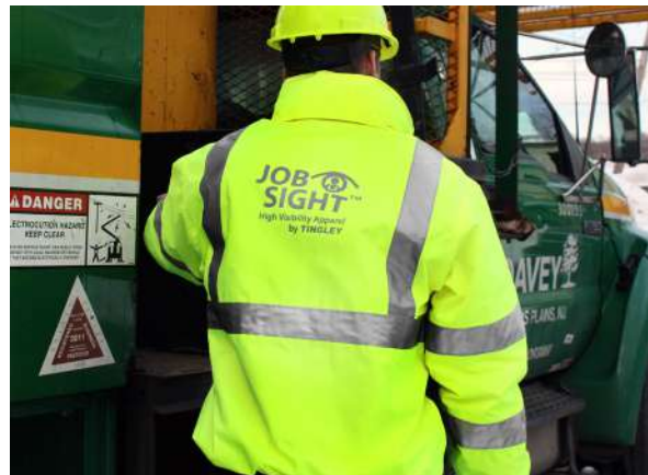
Reflective Heat Transfer