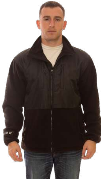
Phase 2 Fleece Jacket J73013 Black - Collared S - 3XL