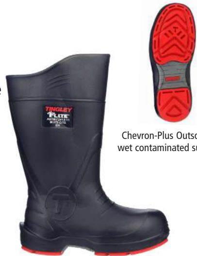
Chevron-Plus Outsole for wet contaminated surfaces

Navy Upper/Red Sole Men's Size: 4 - 15 Women's Size: 6 - 12