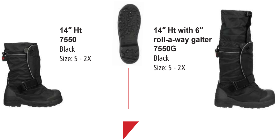
14" Ht 7550 Black Size: S - 2X