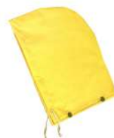
Hood H21107 Yellow - Detachable