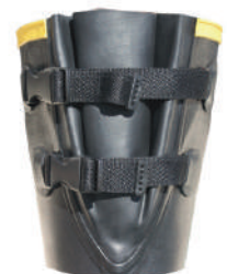
Rear Gusset with Quick Release Buckles