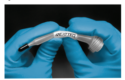
Figure 1 Break Ampoule

Bend smoke generator in the middle to break the ampoule as shown in Figure 1 below.