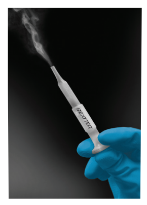
Figure 4 Smoke is Generated

8. Slowly, gently, and uniformly compress the bellows to generate smoke as shown in Figure 4 below.